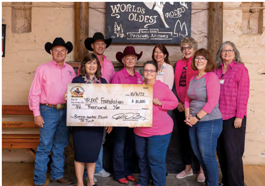
This page, top to bottom, left to right: Barrett Propane “Pink Truck,” Summit 4X4 Company “Trails 4 Tatas,” and Prescott Frontier Days “Tough Enough to Wear Pink.”