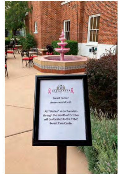
This page, top to bottom, left to right: Capital Canyon Club “Swing for the Cure,” Hassayampa Inn “Wishing Fountain,” Movement Studio “Pink Dance,” Texas Roadhouse “Stompin’ Out Breast Cancer,” Prescott Daily Courier “Pink Pages,” Prescott Police “Pink Patch Project.”