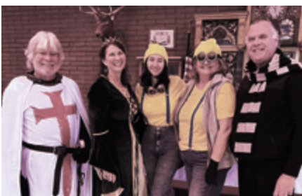
Chores Be Gone – Boo Bash