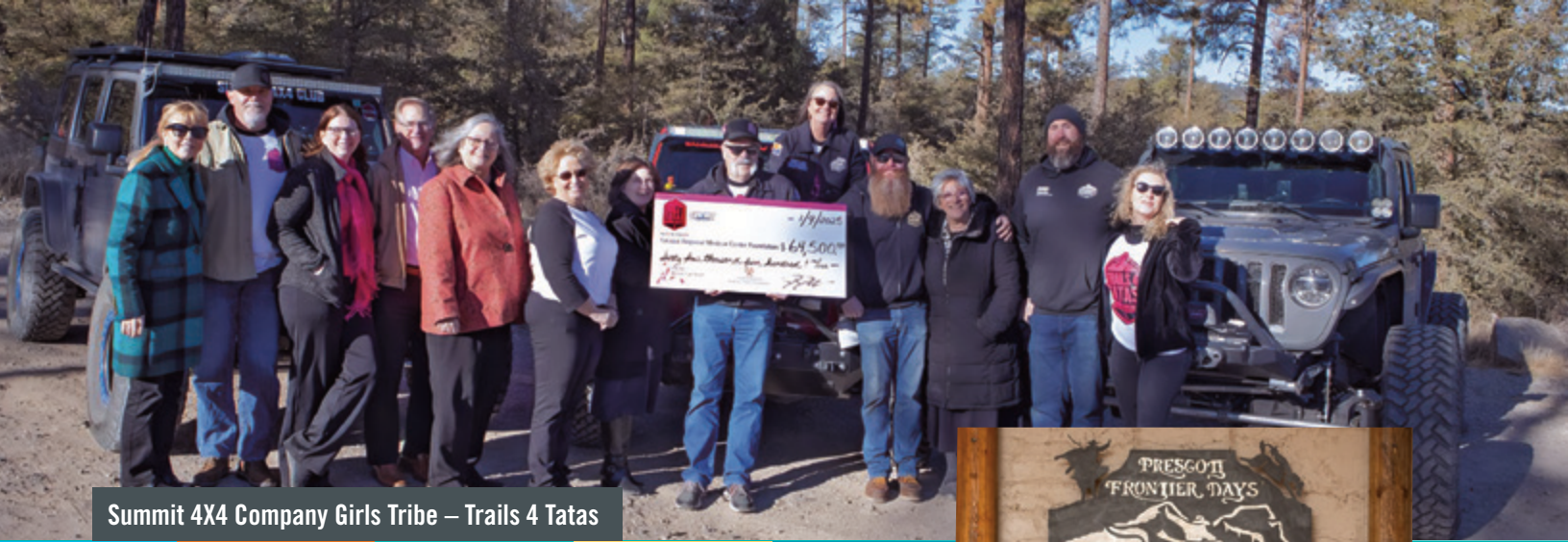
Summit 4X4 Company Girls Tribe – Trails 4 Tatas

This is what Giving looks like! 2024 Breast Care Community Fundraisers