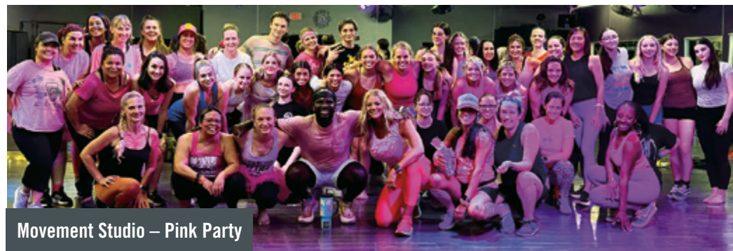
Movement Studio – Pink Party