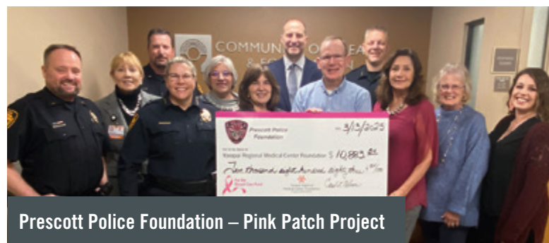
Prescott Police Foundation – Pink Patch Project