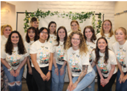
ERAU Alpha Sigma Tau – Think Pink