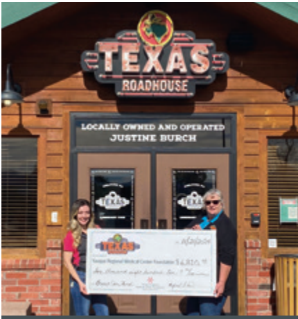
Texas Roadhouse – Stompin' Out Breast Cancer