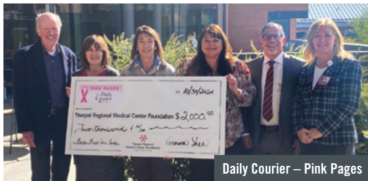
Daily Courier – Pink Pages