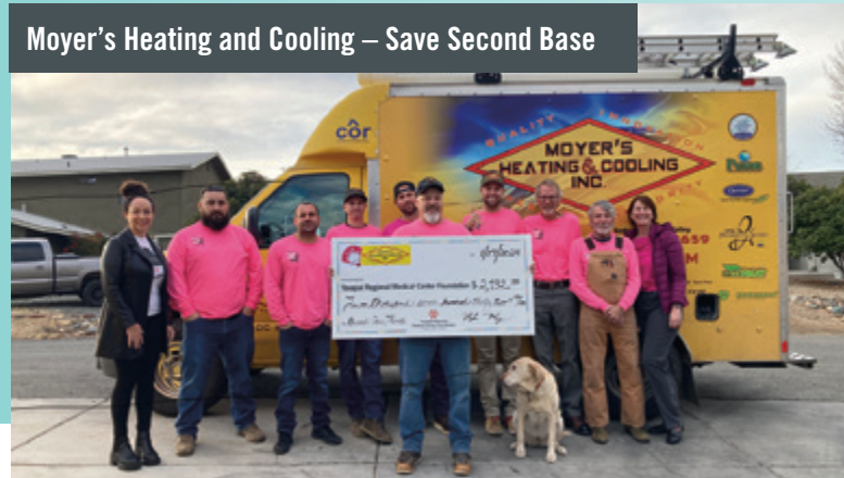
Moyer's Heating and Cooling – Save Second Base