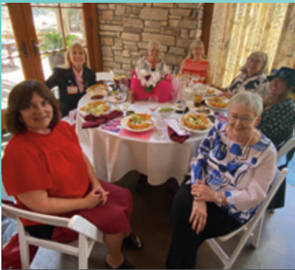
Capital Canyon Club – Fashion Show