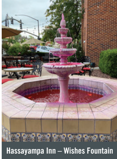
Hassayampa Inn – Wishes Fountain