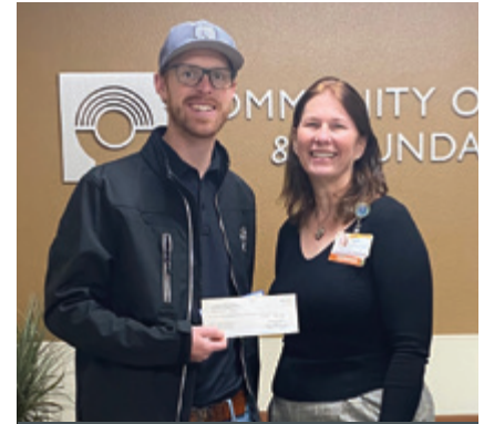
Fork in the Road Restaurants – Boot Out Cancer