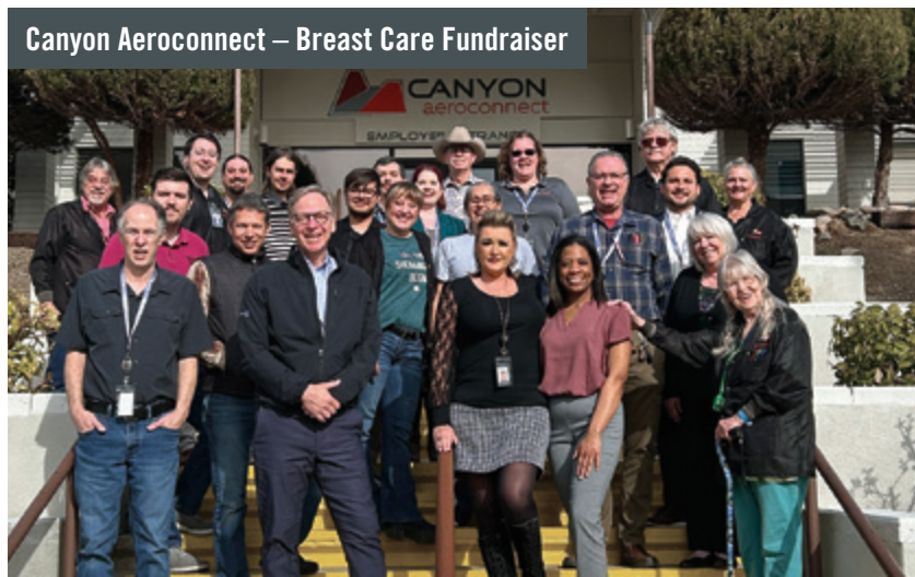
Canyon Aeroconnect – Breast Care Fundraiser