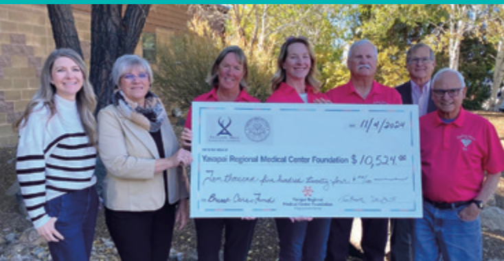
Antelope Hills Women's Golf Assn. & Mile High Men's Club

This is what Giving looks like! 2024 Breast Care Community Fundraisers