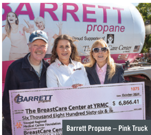
Barrett Propane – Pink Truck